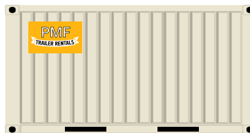
20' GROUND LEVEL STORAGE CONTAINER